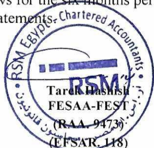
(RSM EGYPT) CHARTERED ACCOUNTANTS

As indicated in note (4), the company has investments in subsidiaries and prepared consolidated financial statements as of 30 June 2022 in accordance with Egyptian Accounting standards, for a better understanding of the company's financial position as of 30 June 2022 and its financial performance and its cash flows for the six months period then ended, the matter necessitates reference to the consolidated financial statements.