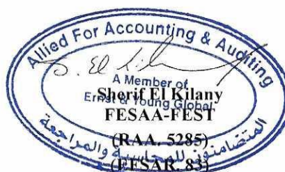
ALLIED FOR ACCOUNTING & AUDITING (EY)